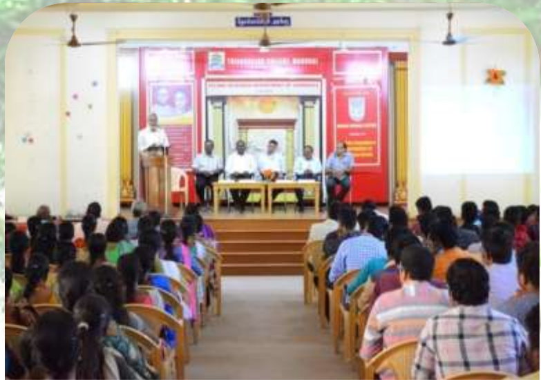
Diamond Jubilee Hall