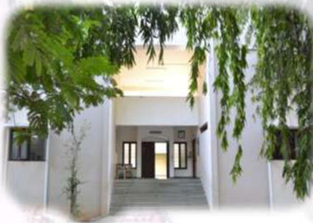
Hostel for Women – Manimegalai Illam