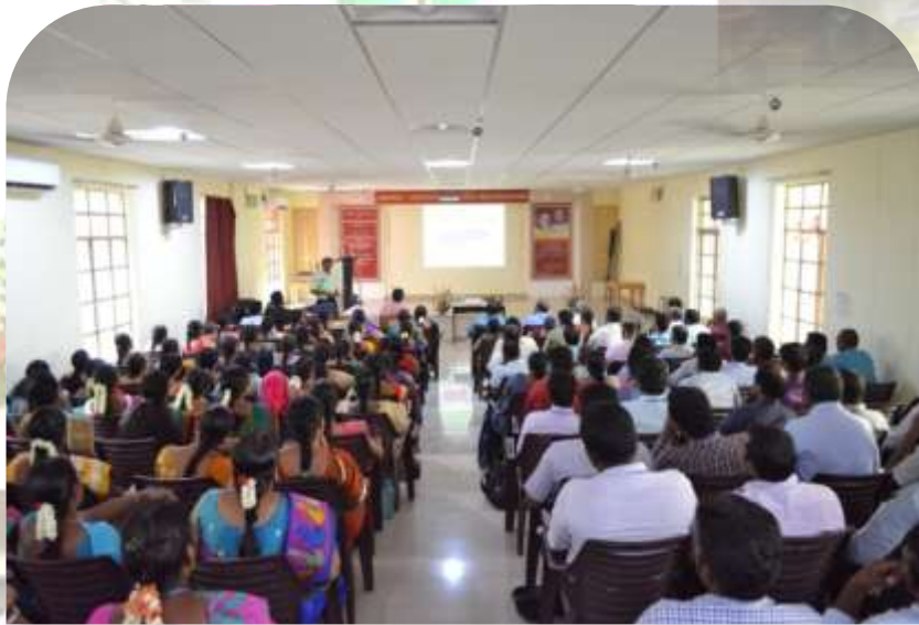
Dr. Radha Thiagarajan Auditorium