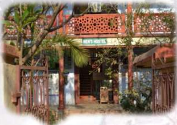
Hostel for Men – Valluvar Illam

The general library and the department libraries have more than 1,05,000 books on various subjects. They have a rare collection of ancient books both in Tamil and English. The periodical section has back-volumes of journals in all disciplines. The library has subscribed for about 100 periodicals and almost all dailies, weeklies, fortnightlies, 60 Talking Books (Ro-talk-audio cassettes) and 300 audio resources for visually-challenged students. Students are encouraged to borrow books from general library for a stipulated period of time and they can also browse internet free of cost.