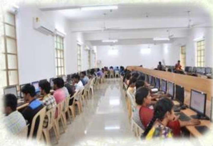
Sri Ramanujan Computer Centre