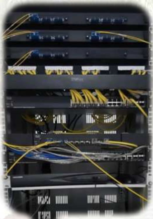
free wifi campus