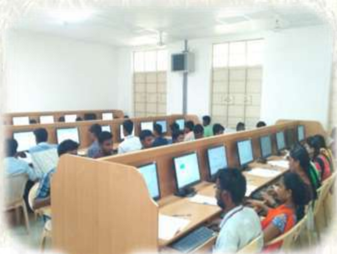
Dr. Radha Thiagarajan Computer Lab